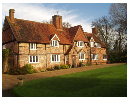
3. Butlers Farm. 16 th century.