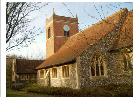
6. St Mary's church is the third on the site. Tower rebuilt 1794, the rest of the church 1860-71