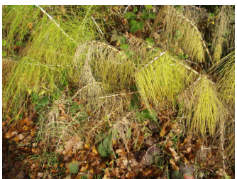
8. Clay Lane is a very ancient route from the Kennet Valley marshes and arable fields to the grazing on Bucklebury Common. Look for horsetail on the banks. A plant unchanged for millions of years. It was used to polish pewter.