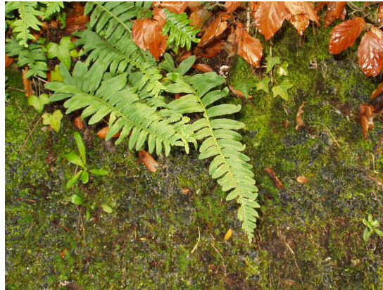
Polypody. A sign of ancient woodland and unusual in West Berkshire. For more detail on the history of Beenham see 'Beenham. A History'. Published by The Beenham History Group in 1999.

The geology very much determines the natural history. A few damp areas survive from the ancient marshes that once existed along the Kennet and these are home to willows and wetland plants. The acid soils further up the slopes are a patchwork of woods and coppices. Some of these, particularly in the deep, narrow valleys, are ancient and home to plants like bluebells, wood anemones, old twisted coppice stools and hazel bushes. Deer, particularly muntjak, are regularly seen and there is a wide range of bird species – including red kites. You may hear wolves howling! These, however, are safely enclosed at the Wolf Conservation Trust!