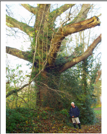
4. 350 year old oak on Path 19