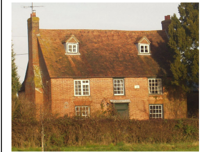
1. Awberry Farm – early 18 th century